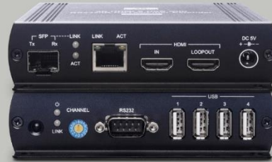
4K30Hz HDMI & USB/IR/RS232/Audio KVM CAT5e/Fiber Optic Extender