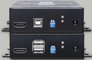
4K60Hz HDMI & USB/IR/RS232 KVM Fiber Optic Extender