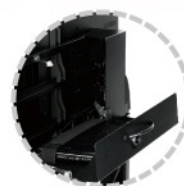
Anti-theft storage case