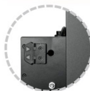
Motorized height adjustment