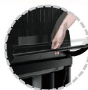
Pull up the handle and tilt the display up or down